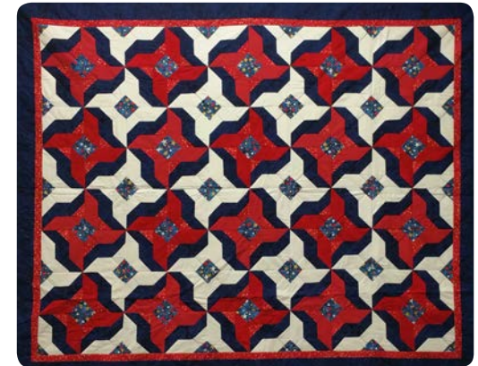
Donated quilt provided to new Warriors in Transition at the SFAC