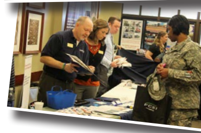
Image descriptions from top to bottom: JBLM AFCS SFAC Front Entrance, Celebrity Wrestling Autograph Event, 2015 Chili Cook-off Winners, JBLM AFCS Education Fair